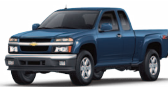
Extended Cab (standard bed; all trims)