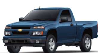
Regular Cab (standard bed; Work Truck, Z85)

GM, the GM Logo, Chevrolet, the Chevrolet Logo, and the slogans, emblems, vehicle model names, vehicle body designs and other marks appearing in this catalog are the trademarks and/or service marks of General Motors, its subsidiaries, affiliates or licensors. The Bluetooth word mark is a registered trademark owned by Bluetooth SIG, Inc., and any use of such mark by Chevrolet is under license. ©2011 OnStar. All rights reserved. ©2011 General Motors. All rights reserved. August 2011