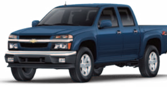
Crew Cab (short bed; Z85, Z71, Sport)